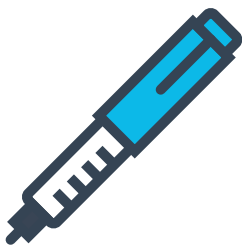
Insulin, needles and pen device

The hospital should provide you with an information starter pack along with everything you need to safely manage your insulin: