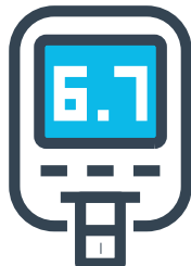
Blood glucose meter with strips & lancets