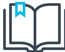
Resources to record your blood glucose and insulin