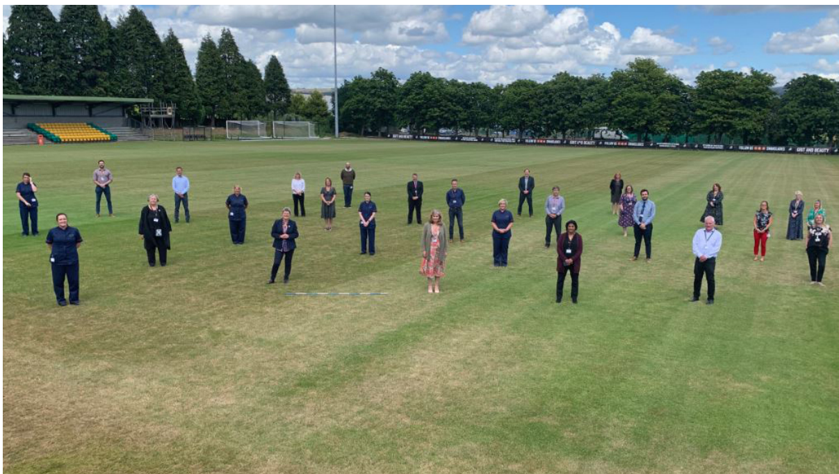
Pictured: Swansea Bay University Health Board staff at the Llandarcy Field Hospital in June 2020.