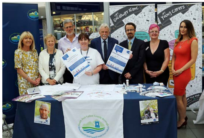
Neath Port Talbot Carers Service with representatives from Neath Port Talbot Local Authority, Abertawe Bro Morgannwg University Health Board and Western Bay Regional Partnership – Carers Week 2018

Swansea Carers Centre have used a portion of the Carers funding made available from Welsh Government to employ a Communication and Information Officer.