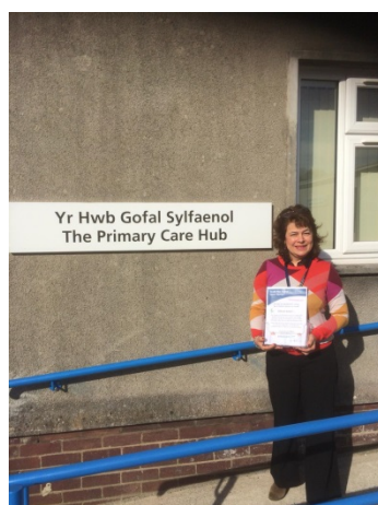
Neath Port Talbot Carers Centre Health Liaison Worker

Neath Port Talbot Carers Service also have contact with the primary care practices in their area and have conducted outreach sessions in 13 centres. The Health Liaison Worker attended all Flu Clinics in the area provides updates to all Practice Managers and updates surgery and practice noticeboards quarterly. This is funded from Integrated Care Fund 2018 -19.