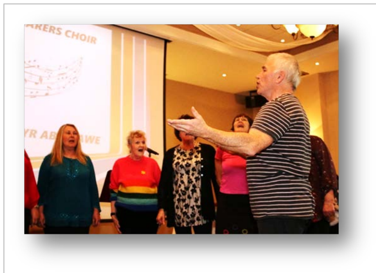
Swansea Carers Choir at the Celebrating Carers Event

Over 100 carers and professionals from across Western Bay came together at the Towers Hotel on the 4 th March. The focus of the day was celebration; to acknowledge and celebrate local Carers who make such a difference to the lives of the people they support, to celebrate new and innovating services which see health, local authorities and Carers Centres/ Service working together to support carers and to celebrate individuals who carers have nominated as having 'gone above and beyond'. The chair of Abertawe Bro Morgannwg University Health Board chaired the event.