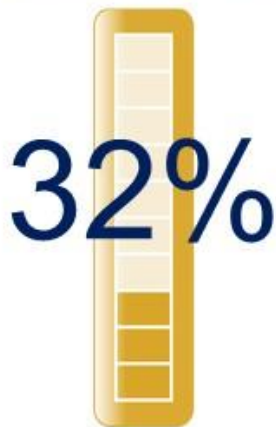
% Completion Rates by Audit Year

% of registered projects that have been completed