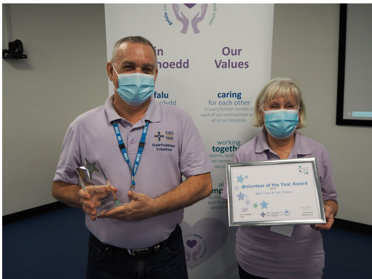
Swansea Bay University Health Board Highlights Report 2021-22